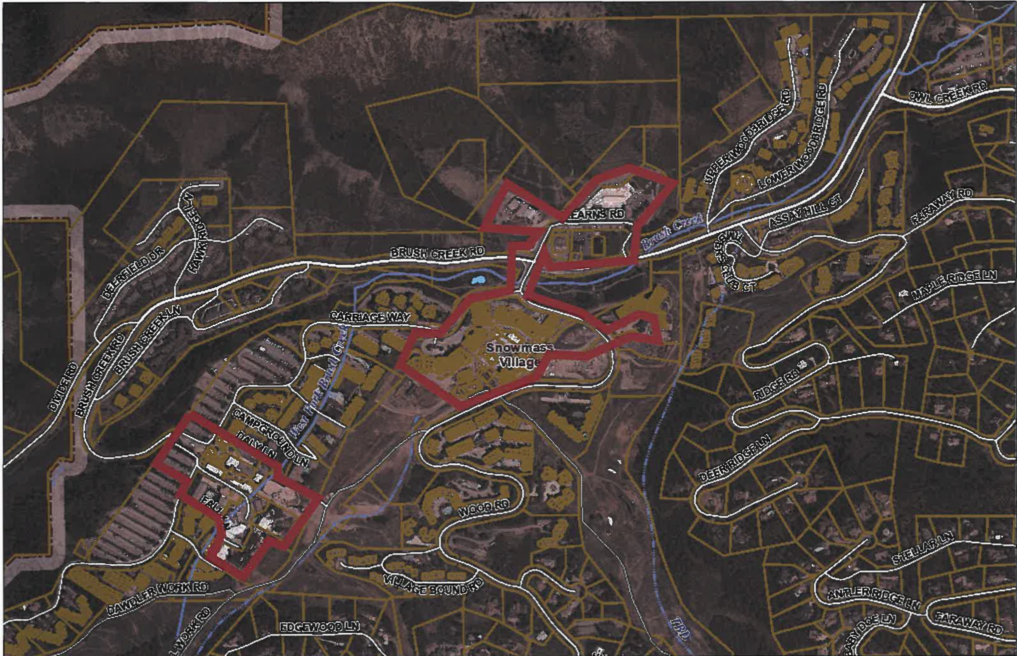
Exhibit A - Ordinance No. 11, Series of 2020 -Town of Snowmass Village Mandatory Face Covering Zones